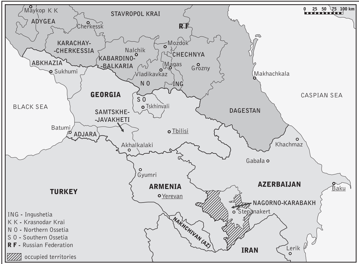
Map 1. Northern and Southern Caucasus